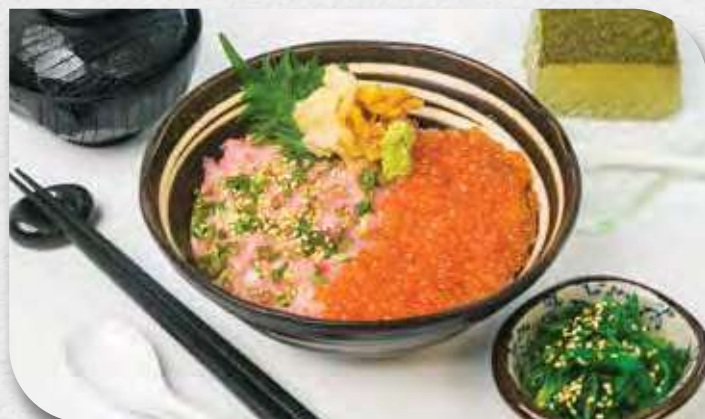
L06. NEGITORO & IKURA DON SET 32.80 Freshly minced maguro, sprinkled with sesame seeds and spring onions & a generous portion of Ikura.