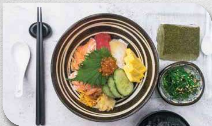
L01. CHIRASHI DON SET 23.80 With premium sashimi assortment