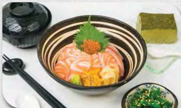
L02. SHAKE DON SET 20.80 Freshly cut slices of Norwegian salmon rice.