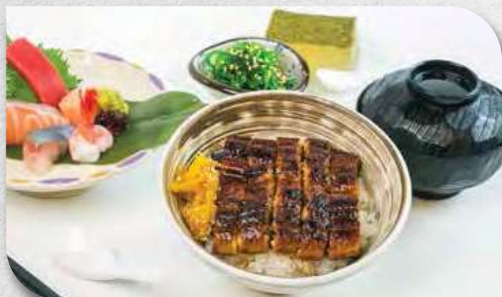
L05. SASHIMI UNAGI DON SET 28.80 Grilled eel slather with home-made unagi sauce over Japanese rice. Served with assorted sashimi.