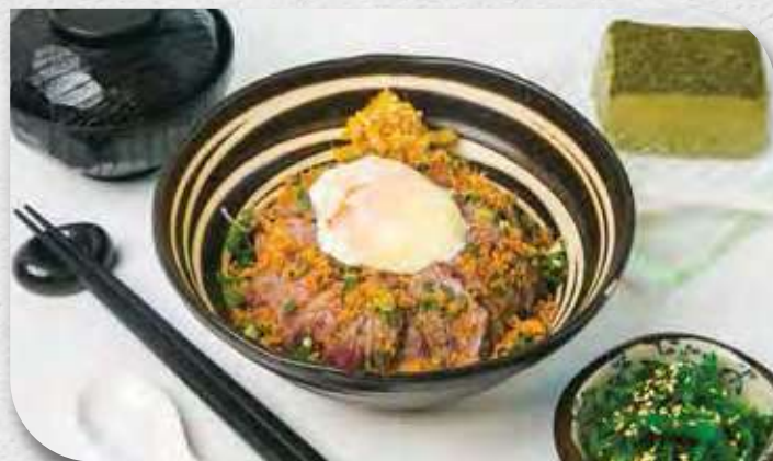
L04. WAGYU DON SET 26.80 Sautéed beef with onsen egg over fragrant & fluffy rice.